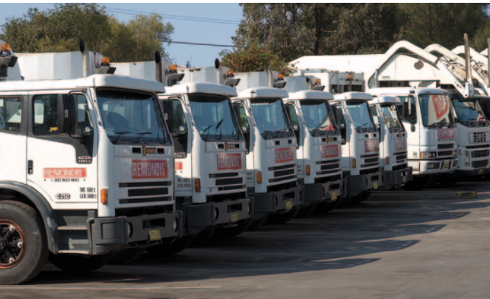
REMONDIS has a fleet of vehicles in operation Australia wide